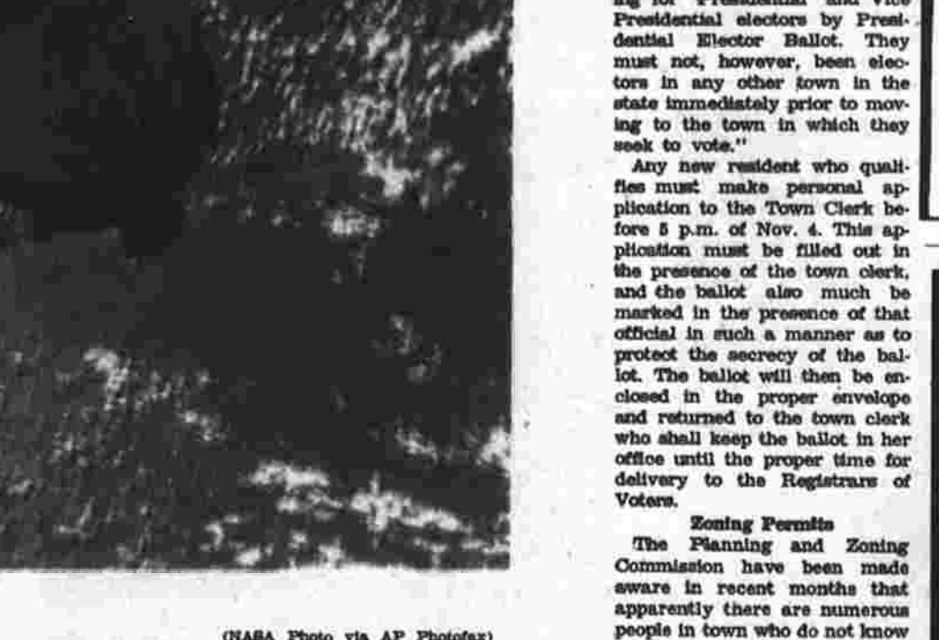
High Above Launch Area The expended Saturn IVB stage is shown as photographed from the Apollo 7 spacecraft during docking maneuvers at altitude of 125 miles above Cape Kennedy, Florida.